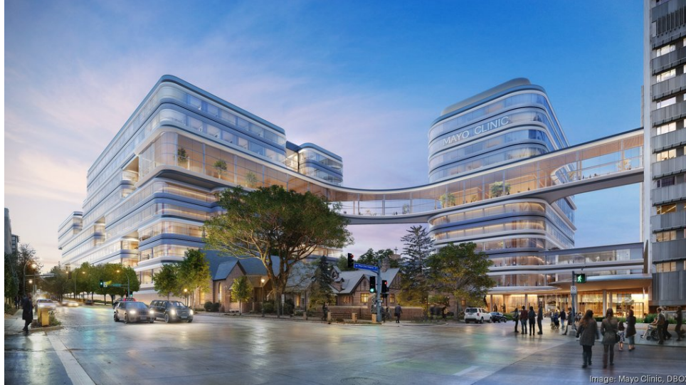
A rendering of two of the five buildings planned by Mayo Clinic in downtown Rochester.