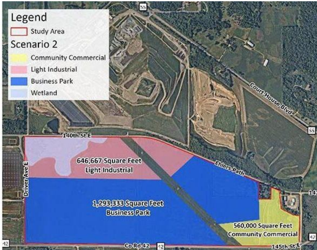
One development scenario for 333-acres of agricultural land at County Road 42 and Emery Avenue East in Rosemount would feature 1.29-million-square-feet of a business park, over 645,000-square-feet of light industrial development, and 560,000-square-feet of community commercial.

Just over a month after the Rosemount City Council unanimously approved a 750,000-square-foot data center to be built for Meta, it's possible that another data center could be coming to town following a review of an area commonly called Rich Valley East. According to public documents, an alternative urban areawide review, or AUAR, of 333-acres of agricultural land at County Road 42 and Emery Avenue East in Rosemount is happening at the request of a firm called Project Mercury LLC to determine whether the area could be for a data center or an industrial park. (Finance & Commerce)