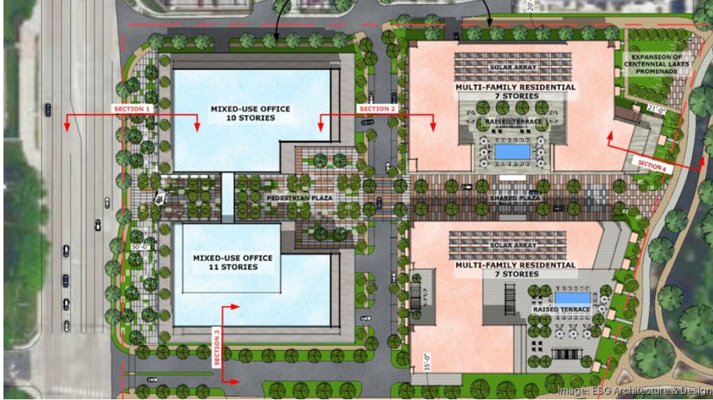
An overview of what could rise on the Macy's Furniture store site in Edina under plans from developer Enclave Cos. (Image: ESG Architecture & Design )