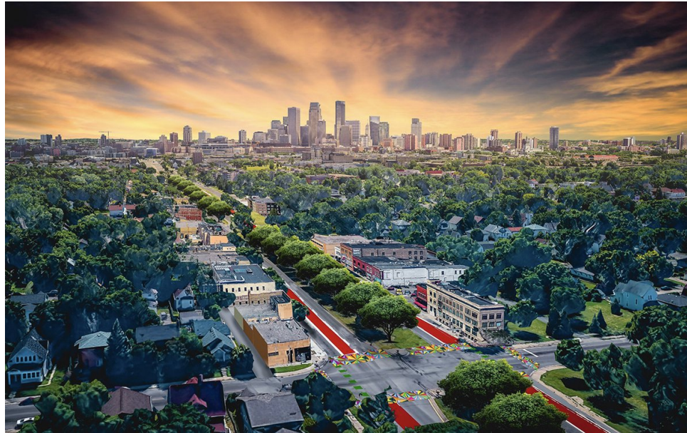
A rendering of a reimagined Olson Memorial Highway corridor.

The federal government awarded $1.6-million to a Minneapolis advocacy group to study redeveloping Olson Memorial Highway as a transit-and-pedestrian-oriented boulevard. Highway 55 is currently one of Minneapolis' deadliest streets. Advocates want to address that and restore a long-lost commercial district that the highway paved over. MnDOT also received a $3.6-million planning grant from the same federal program to study bus rapid transit on a longer stretch of Highway 55 between Minneapolis and Medina. ( Axios Twin Cities )