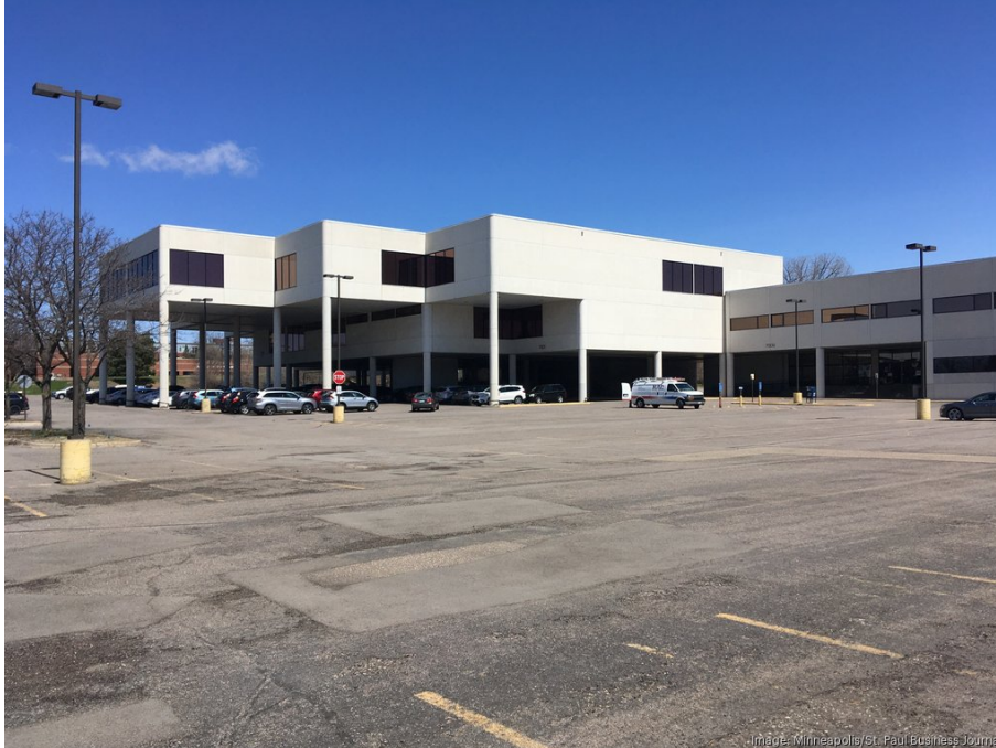
Hennepin County is anticipating to demolish the existing Southdale Library.