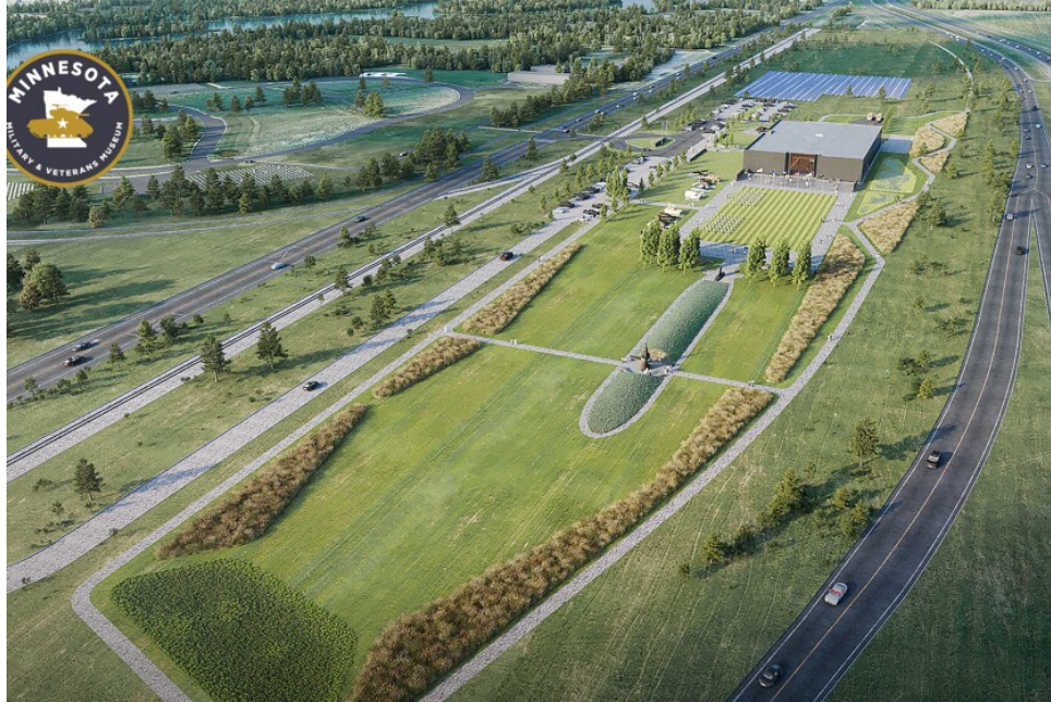
Rendering of the new Minnesota Military and Veterans Museum, which will be constructed just outside the walls of Camp Ripley along Highway 371 near Little Falls, Minn. See more